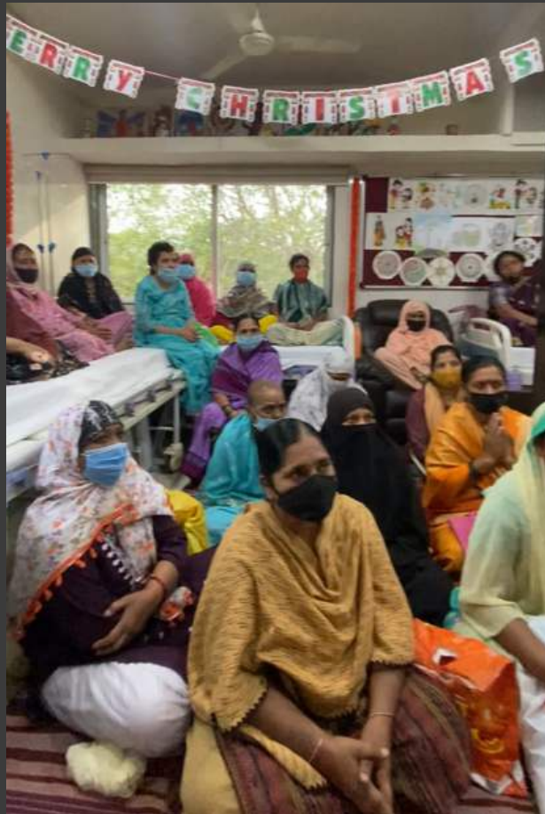
Visit to Vishranti Cancer Palliative Care Centre